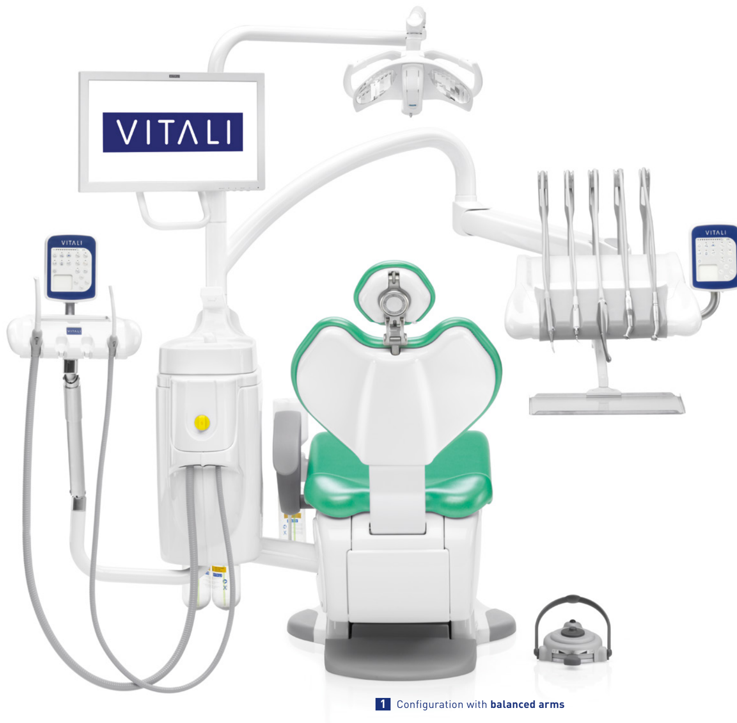
1 Configuration with balanced arms

Just like for any other VITALI unit, the high quality of T5 EVO PLUS 4.0 is demonstrated not only by its functionality and performance, but also by the small number of maintenance and assistance interventions required over time.