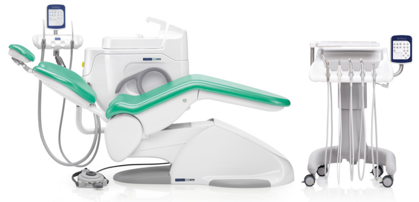
T5 EVO PLUS 4.0 CART